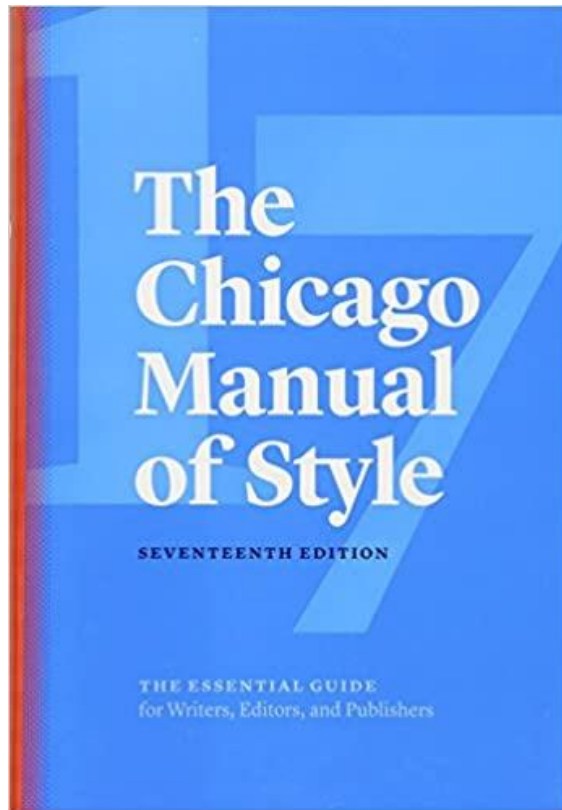
Official CMOS 17 (2017)