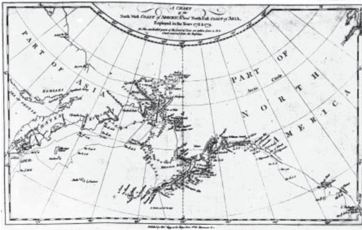
Plate 888. Map published around 1781 by Anderson-Hogg of Cook's west coast discoveries.

Entry 1138.