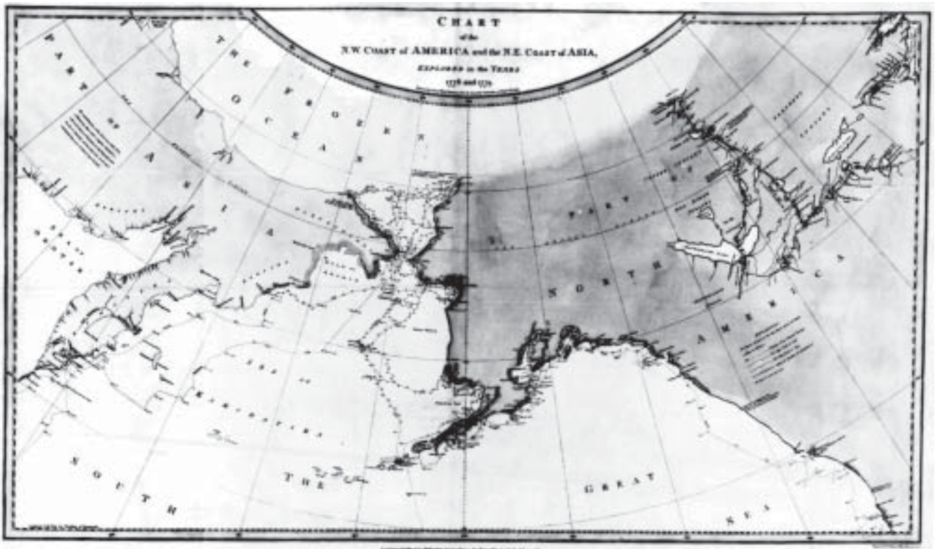
Plate 892. Faden's map published in 1784 of Cook's west coast discoveries. This is the first state of this map which was subsequently twice updated. Entry 1143.