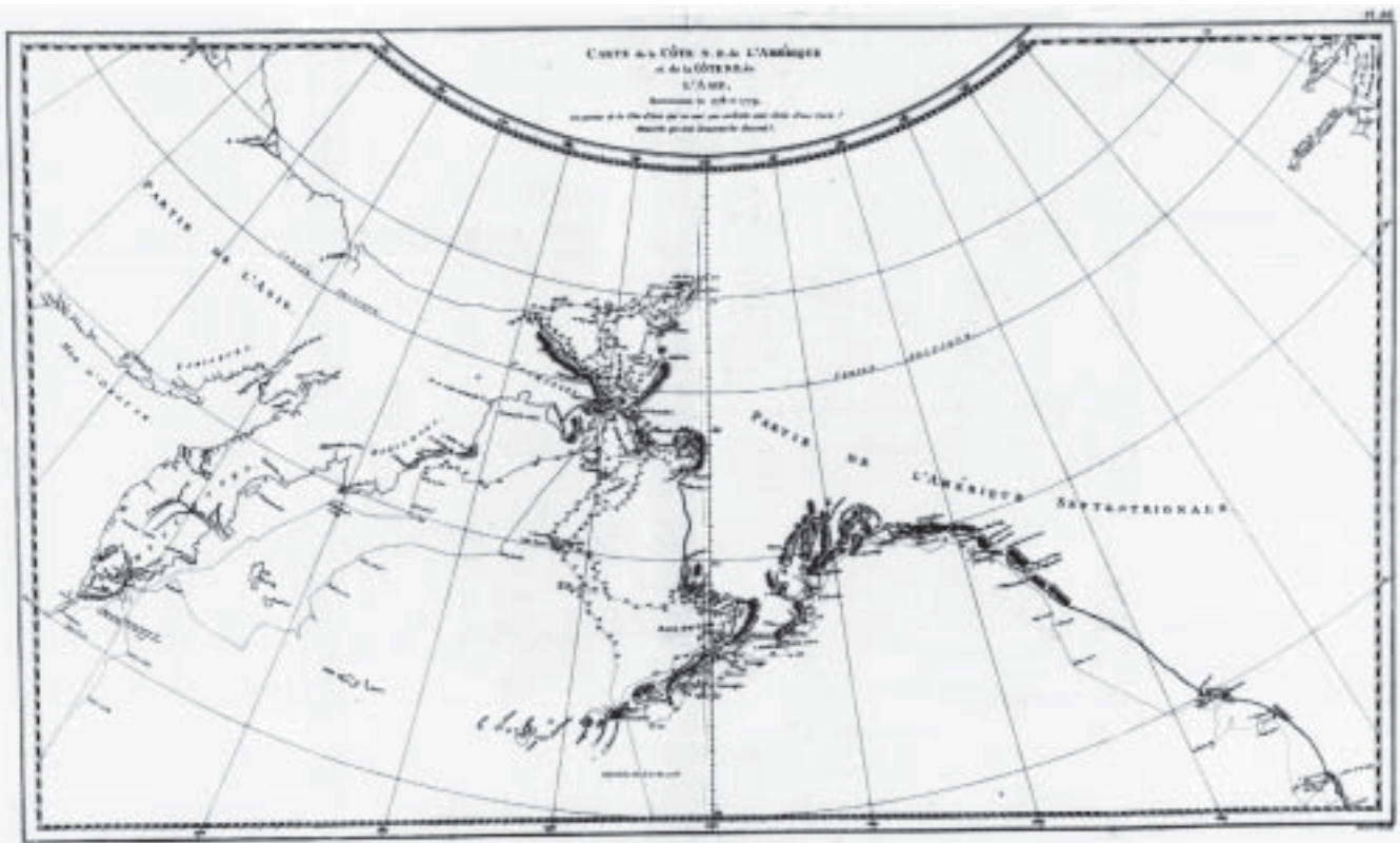
Plate 893. A map published around 1784 by Bernard of Cook's west coast discoveries.

Entry 1144.