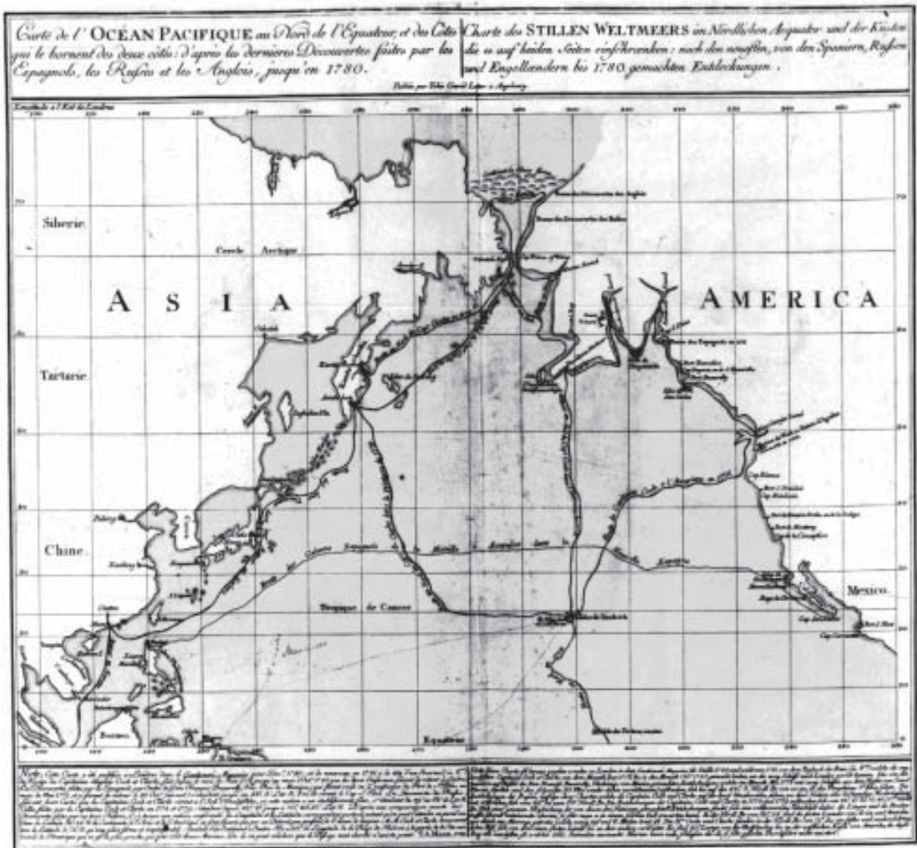
Plate 887. Lotter's map published around 1781 of Cook's west coast discoveries.

Entry 1137.