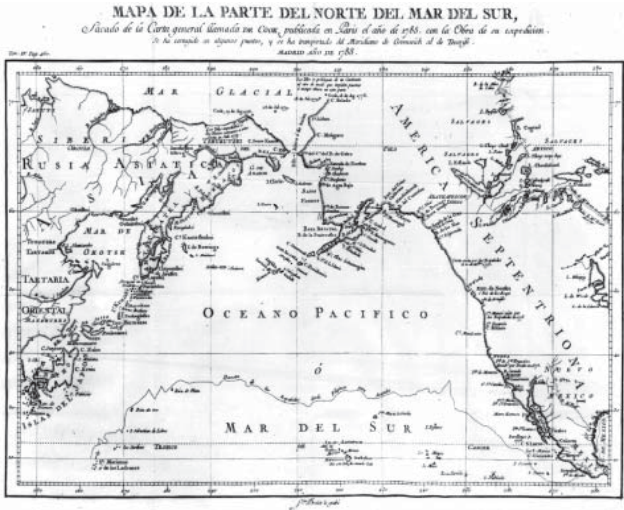
Plate 899. Map published by Malo de Luque in 1788 of the west coast discoveries.

Entry 1150. (Courtesy of the Carter Brown Library).