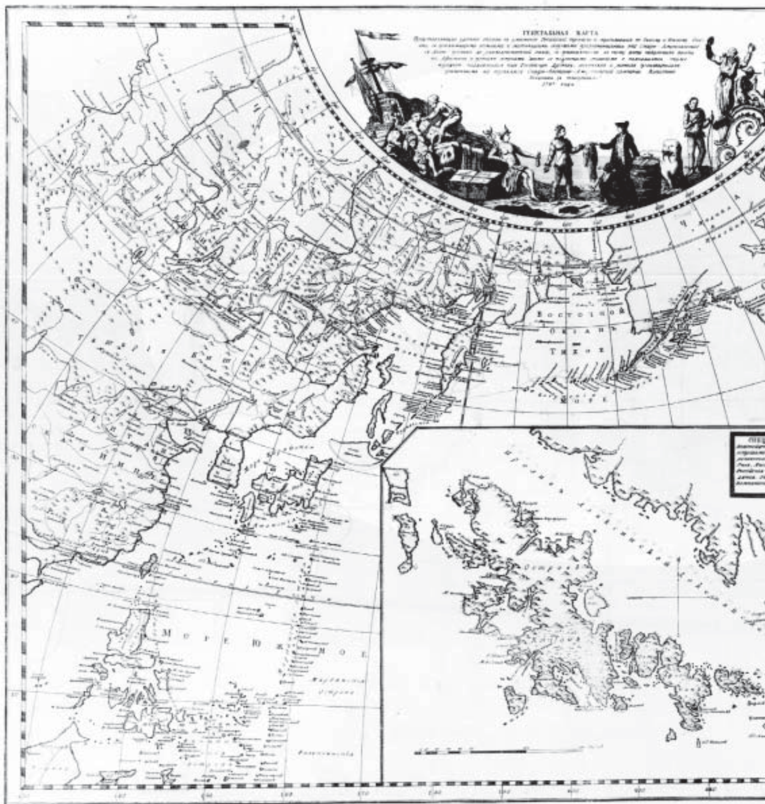
Plate 896. A map published in 1787, by Shelekhov, showing considerable detail of west coast discoveries, particularly by Russia. Entry 1147.