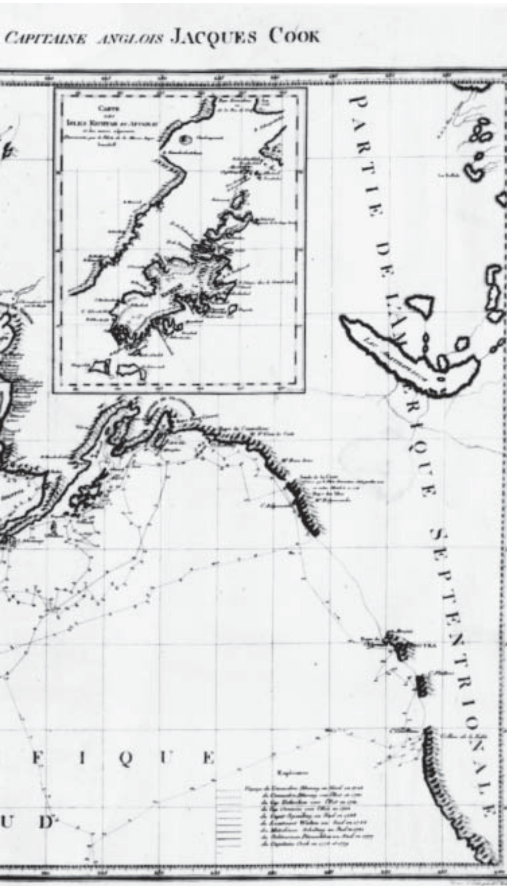
Plate 897. Map published by Wilbrecht in 1787 of Cook's west coast discoveries.