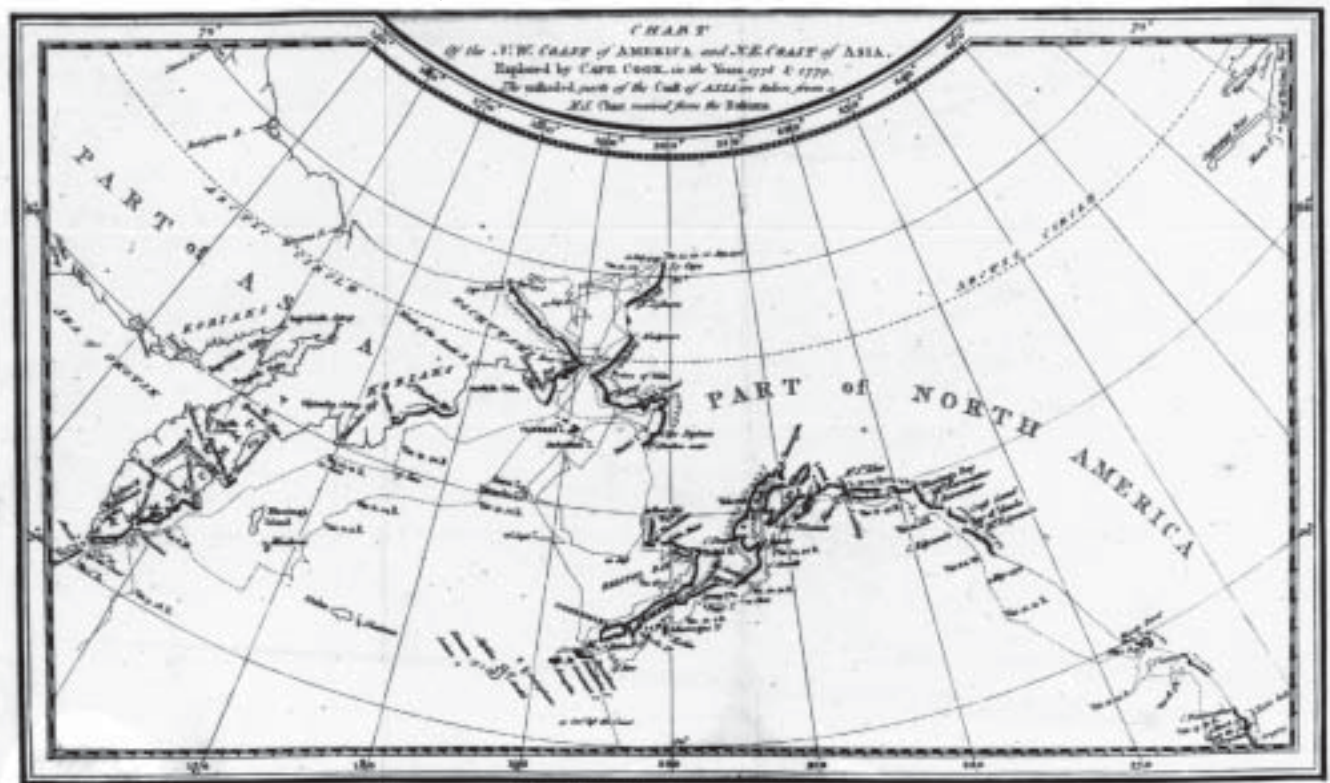
Plate 894. Harrison's map published in 1784 of Cook's west coast discoveries.

Entry 1144.