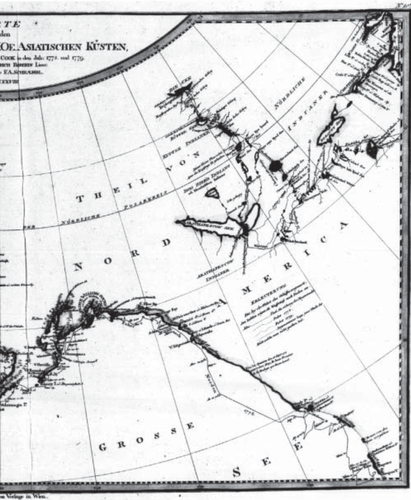
coast discoveries. Entry 1149.