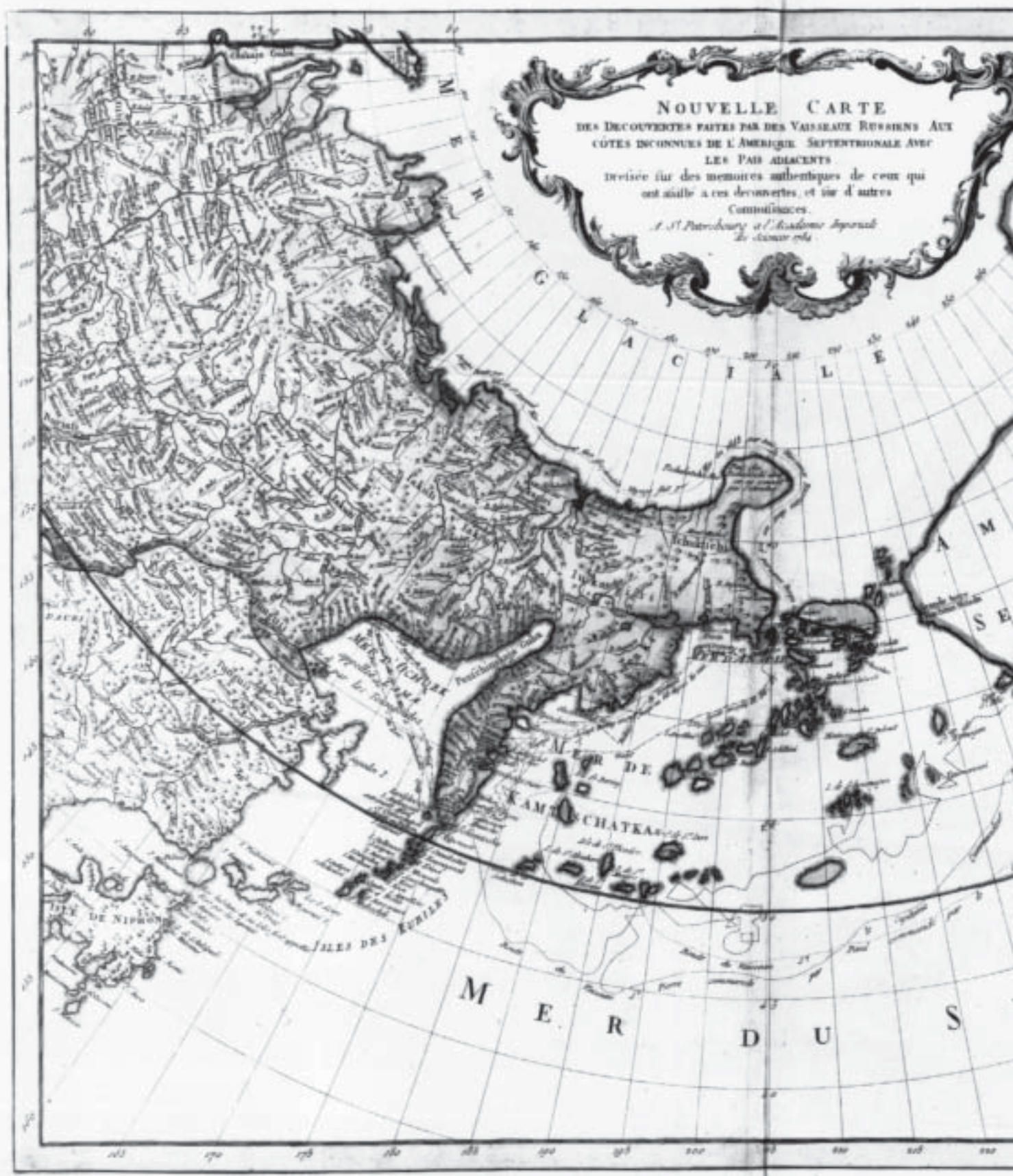
Plate 895. The somewhat outdated map of the west coast published by Santini-Remondini in 1784. Entry 1146.