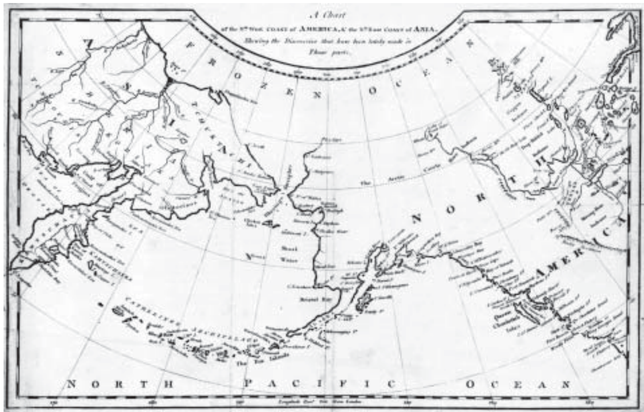
Plate 891. An anonymous map published around 1784 of Cook's west coast discoveries. Entry 1142.