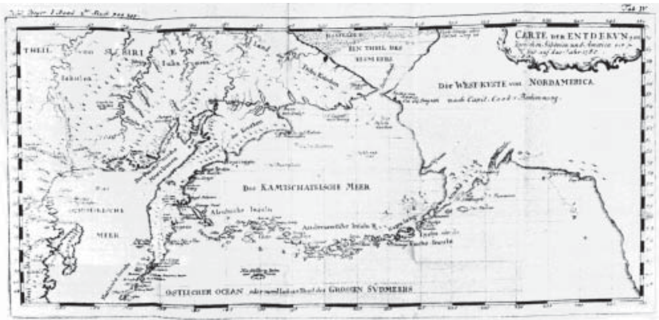
Plate 885. Map by Pallas published in 1781 of the west coast discoveries. Entry 1135. (Courtesy of Rare Books, Library of Congress ).

Published in: A New Genuine and Complete History of the whole of Capt. Cook's Voyages. London (1781) NMC 6923; Beinecke Eeca 784A. Ref: Falk 1983; Wagner # 676.