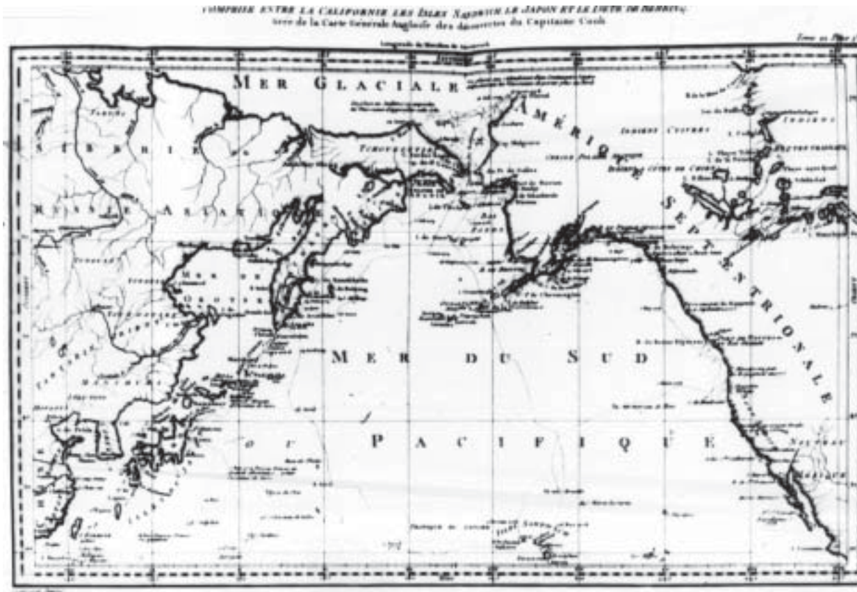
Plate 889. Map published in 1782 of Cook's west coast discoveries. This appeared in La Harpe's

Entry 1138. ( Courtesy of the National Archives of Canada ).