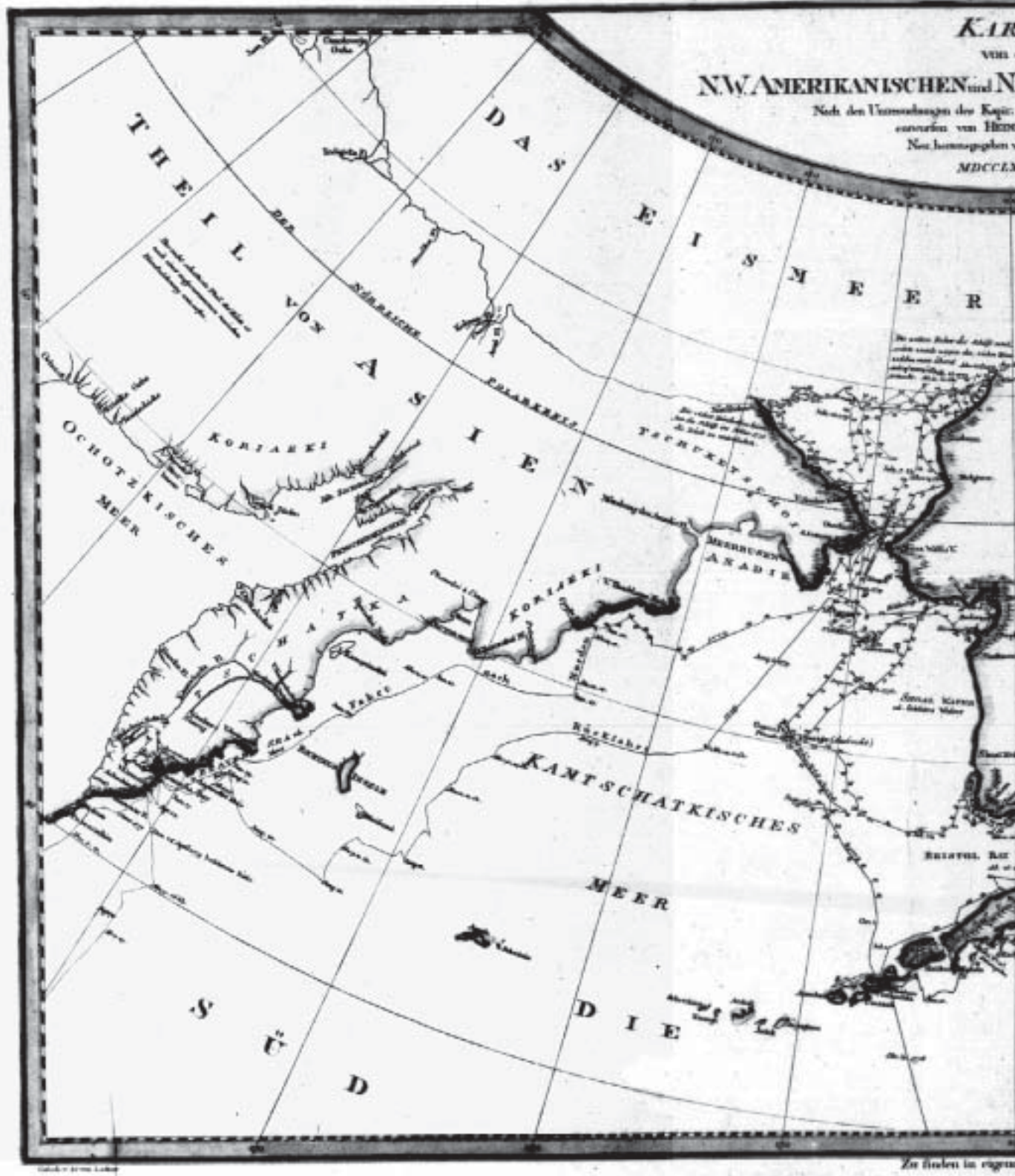
Plate 898. Map published by Schraembl in 1788 of Cook's west